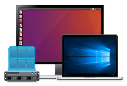
Virtual Machine Manager

A modern file system designed to address obstacles often encountered in enterprise storage systems, safeguarding data integrity through metadata mirroring, self-healing and snapshot replication.